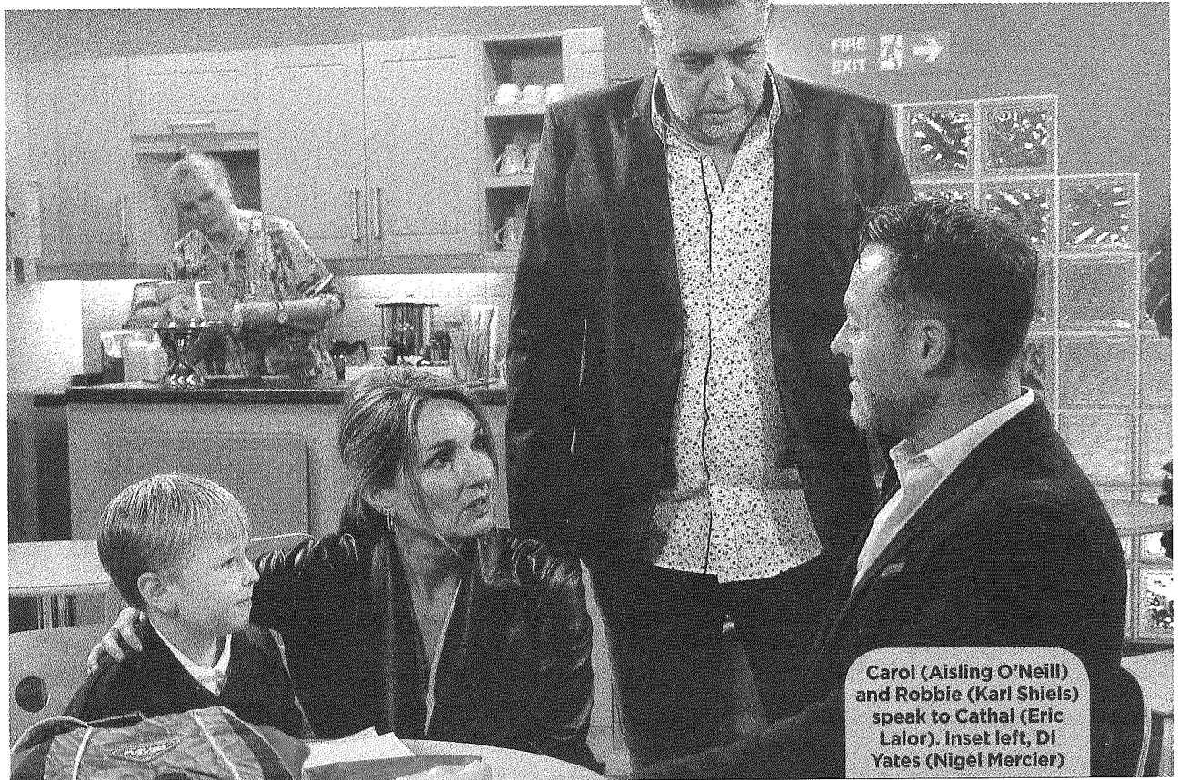
Fair City airs tonight on RTE One at 8pm

Pete urges Dolores to give Orla and Wayne a trial run at managing the businesses before forming a family company.