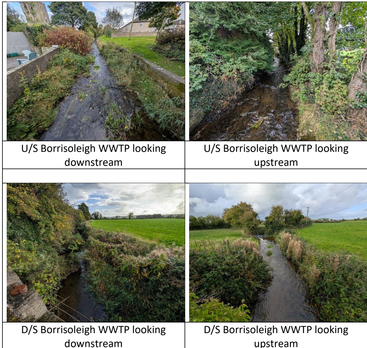
Figure 2. Upstream (U/S) and downstream (D/S) of Borrisoleigh WWTP.

Figure 2 shows photographs taken when sampling upstream and downstream of the Borrisoleigh WWTP on 7 October 2024.